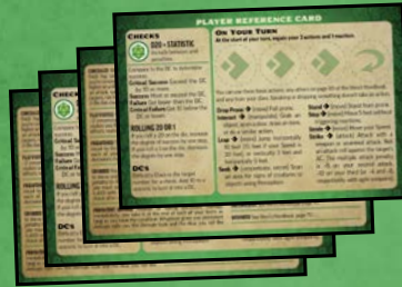
4 Player Reference Cards