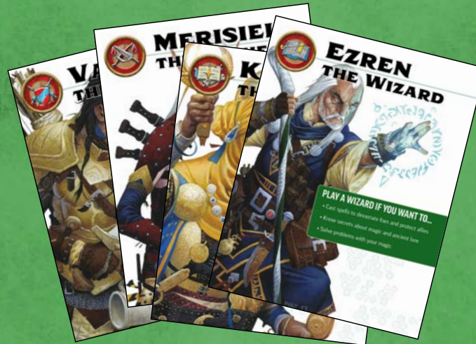
4 Pregenerated Character Sheets