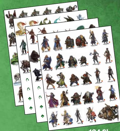
124 Character and Monster Pawns (plus 4 sets of action tokens)