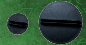
13 Plastic Pawn Bases (including 1 large base)